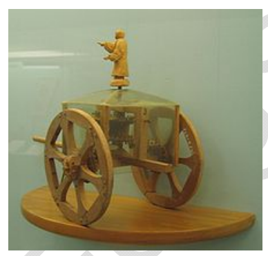
Figure 1 - picture from Wikimedia

It was said that according to legend, Qi Men Dun Jia was taught to Yellow Emperor (黃帝/黄帝 Huáng Dì - 2697 BC to 2597 BC) by a fairy, 九天玄女 (Jiǔ Tiān Xuán Nǚ). During that